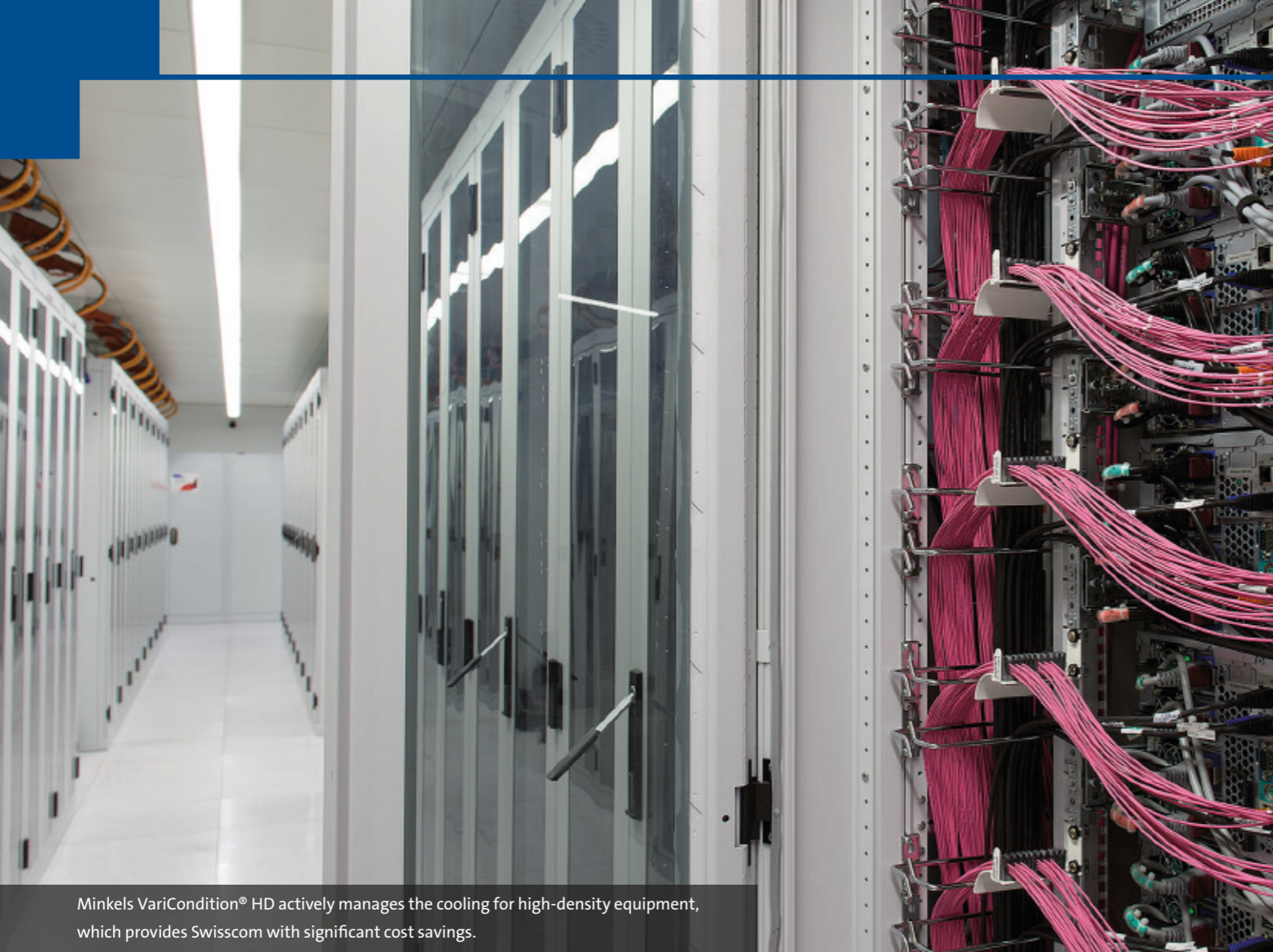
Minkels VariCondition® HD actively manages the cooling for high-density equipment, which provides Swisscom with significant cost savings.